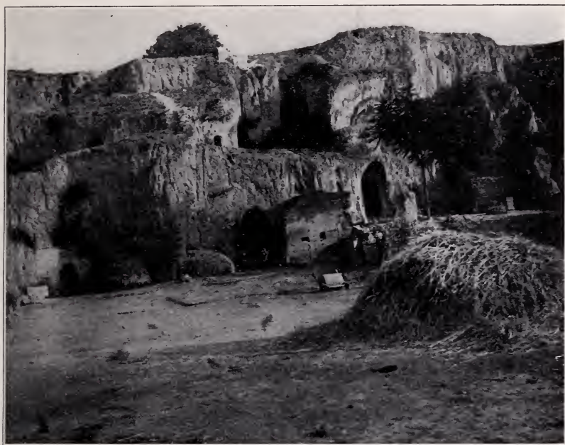
CAVE DWELLINGS IN SHENSI.

Although the replica is not yet the property of the museum, there is a probability that it may never leave its new abode again; but the fact should not be overlooked that all museums and universities of the world can now be supplied, if so desired, with plaster casts of the Nestorian tablet, casts which would not be more accurate, had they been taken from the original itself.